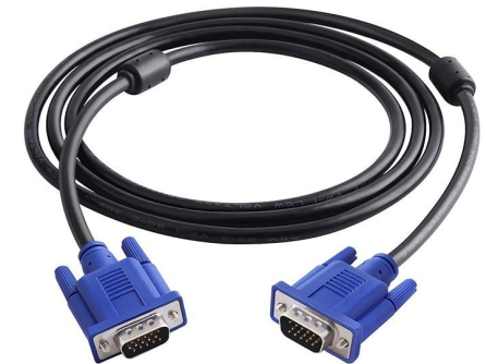
VGA Monitor Cord