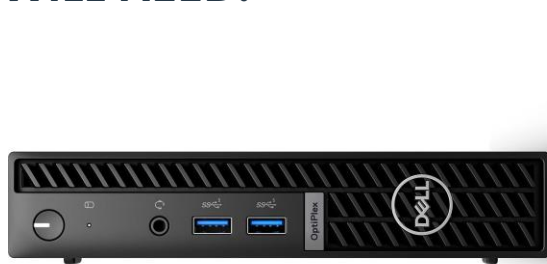
Dell OptiPlex 7010 Micro XCTO (OD/DELL PC)