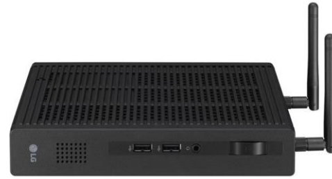
LG CL600N Thin Client Quad Celeron (Retail/Ciao! PC)