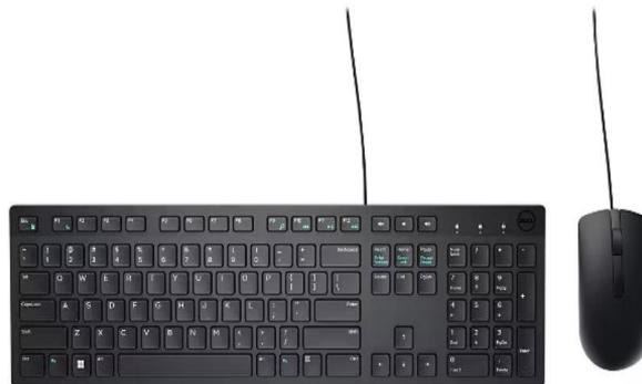
Wired Keyboard & Mouse Style may vary but must be wired