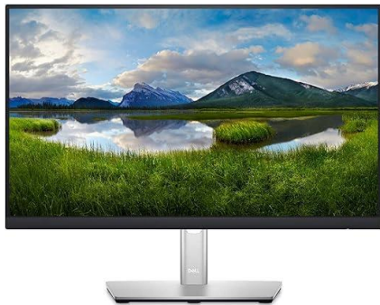
Monitor Style may vary