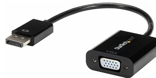
StarTech DisplayPort VGA Activ Converter