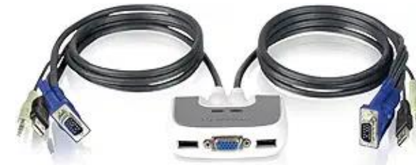
KVM Switch IOGEAR model GCS632U